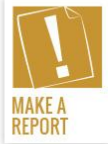
MAKE A REPORT